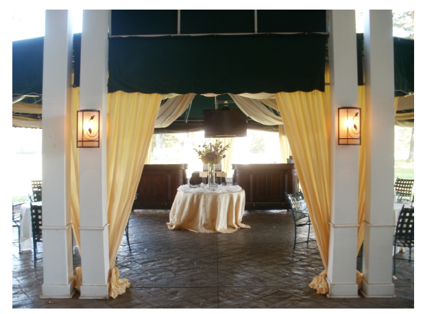
Bars are located outside under the awning. There is a 50 inch flat screen TV for your use. Bring in a DVD of pictures for your guests to enjoy! The floor under the awning is heated if needed. Stand-alone heaters are also available.