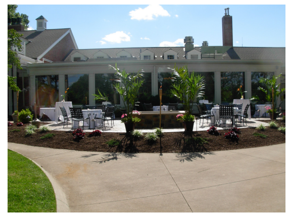
There are 15 patio tables for your guests to enjoy the outdoors. Fire-pit will be turned on at dusk.