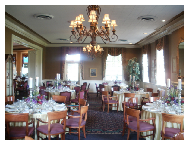
There are 2 beautiful wood burning fireplaces.