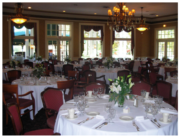
All table settings, glassware and linen is provided to you at no charge. Centerpieces are not provided.